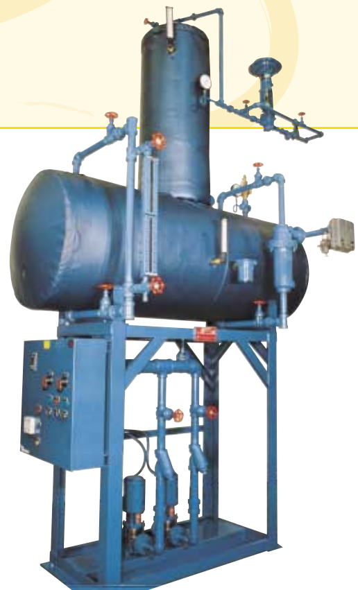
Zer-O-Pac Class "P" System with Class "I" Insulation