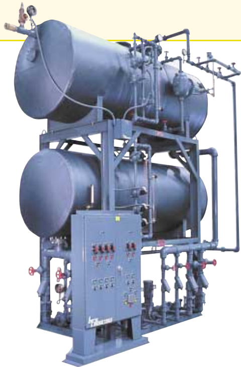
Zer-O-Pac Over/Under – Deaerator/Surge System with Class "I" Insulation

TANK INSULATING SYSTEMS by BFS Industries, LLC