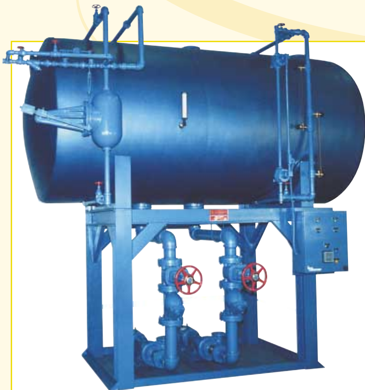
Feed-Pac System with Class "I" Insulation